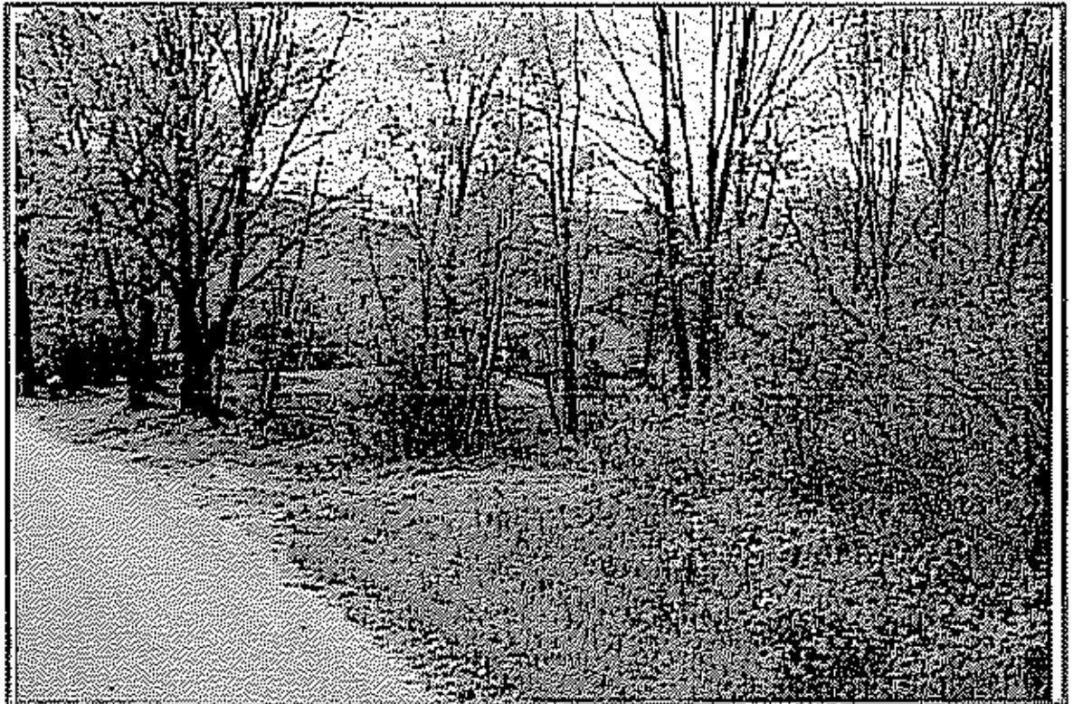
P H O T O #68