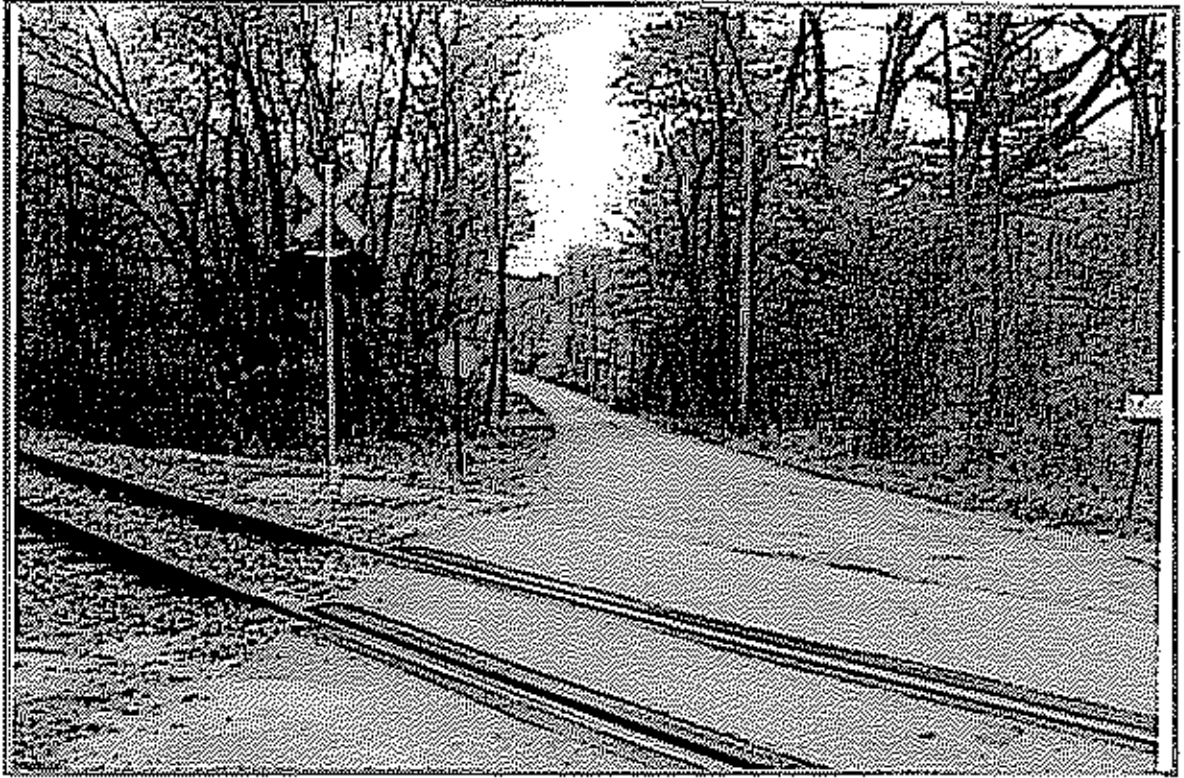
P H O T O #59