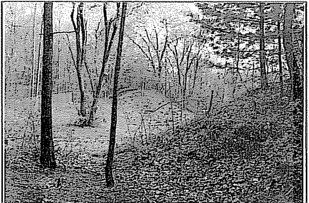
P H O T O #64